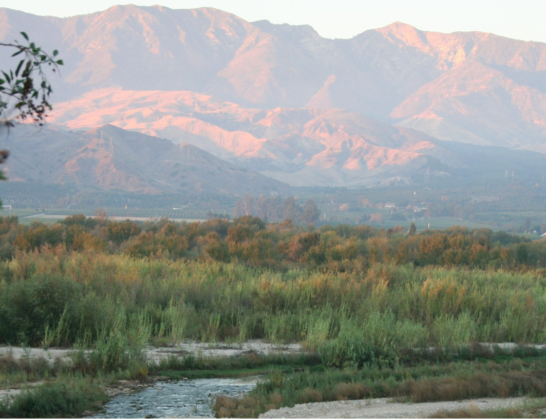
“Lower Santa Clara River”