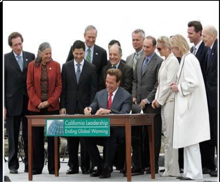
Gov. Schwarzenegger signs AB 32 into law (2006)