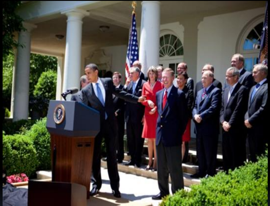
President Obama Recognizes Senator Pavley for AB 1493 model legislation at the White House (2010).