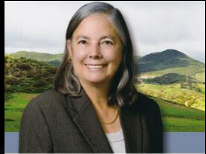
State Senator Fran Pavley (SD 27)