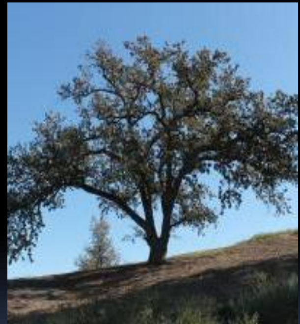
Beautiful Oak Tree in Santa Clarita