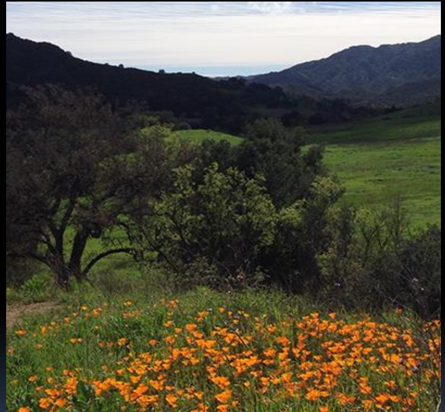
Open Space in Senate District 27