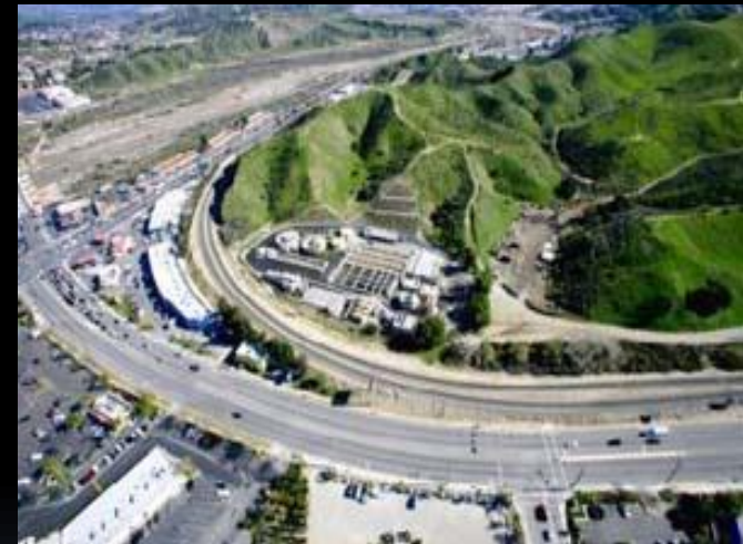
Saugus Water Reclamation Plant